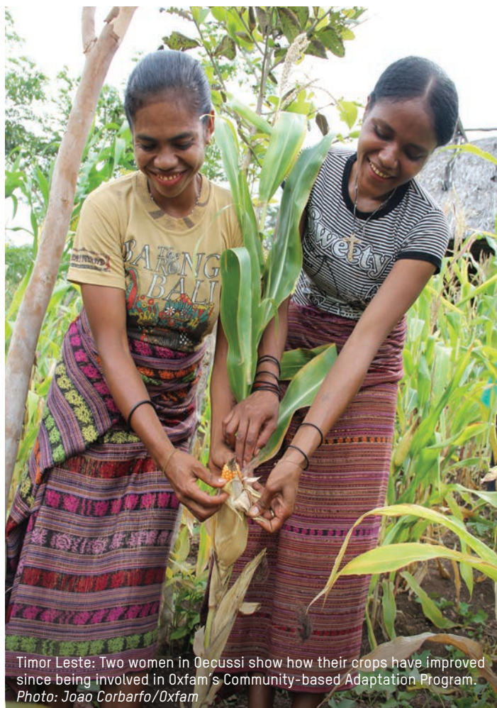
Timor Leste: Two women in Oecussi show how their crops have improved since being involved in Oxfam’s Community-based Adaptation Program.

Given the growing recognition of the need for transformative change for climate change adaptation, more needs to be done to understand advocacy and influencing processes at a national and sub-national level.