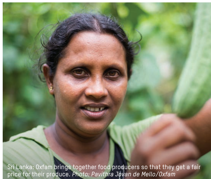
Sri Lanka: Oxfam brings together food producers so that they get a fair price for their produce.