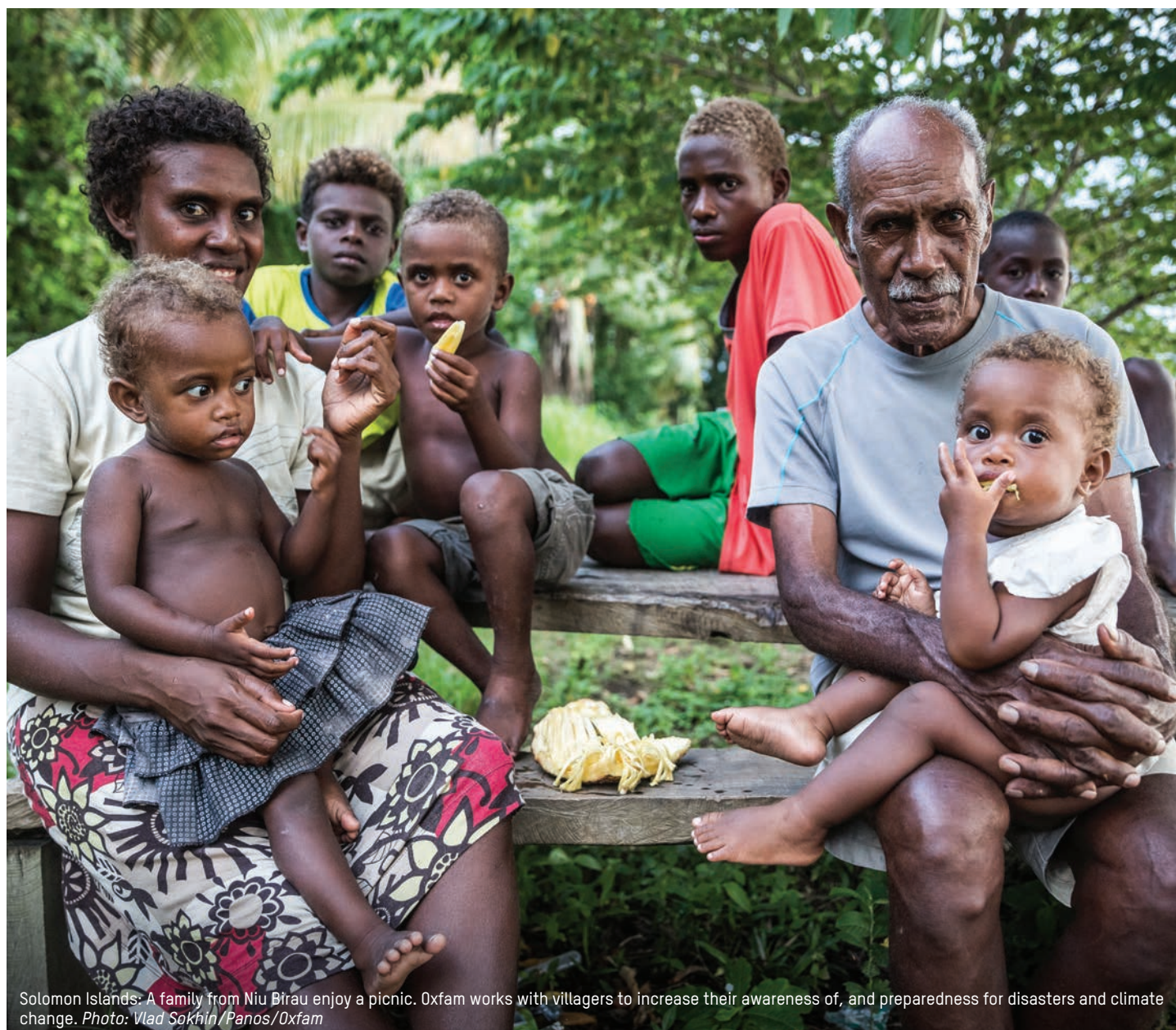
Solomon Islands: A family from Niu Birau enjoy a picnic. Oxfam works with villagers to increase their awareness of, and preparedness for disasters and climate change.

While local capacity is important, some of the outcomes in key finding 2 demonstrate the value of linking community disaster management groups to local government — both the local authorities, such as village committees or councils, but also the agencies responsible for disaster risk management and climate change adaptation. This support builds accountability and increases good governance. It also recognises that while communities may often be first responders, disasters can exceed their capacity to cope. During disasters, these groups can be effective conduits between the government structures and communities.