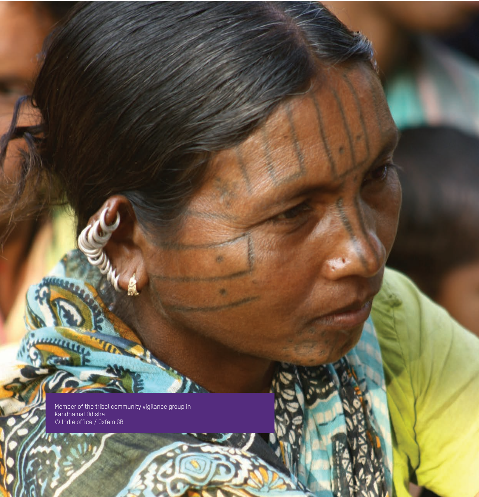
Member of the tribal community vigilance group in Kandhamal Odisha

mainstreaming within Oxfam India's programs. Oxfam India is now documenting it as case study that will be used within the TLWR trainings and mainstreaming initiatives to enable convergence with gender and other programs such as sustainable agriculture and education.