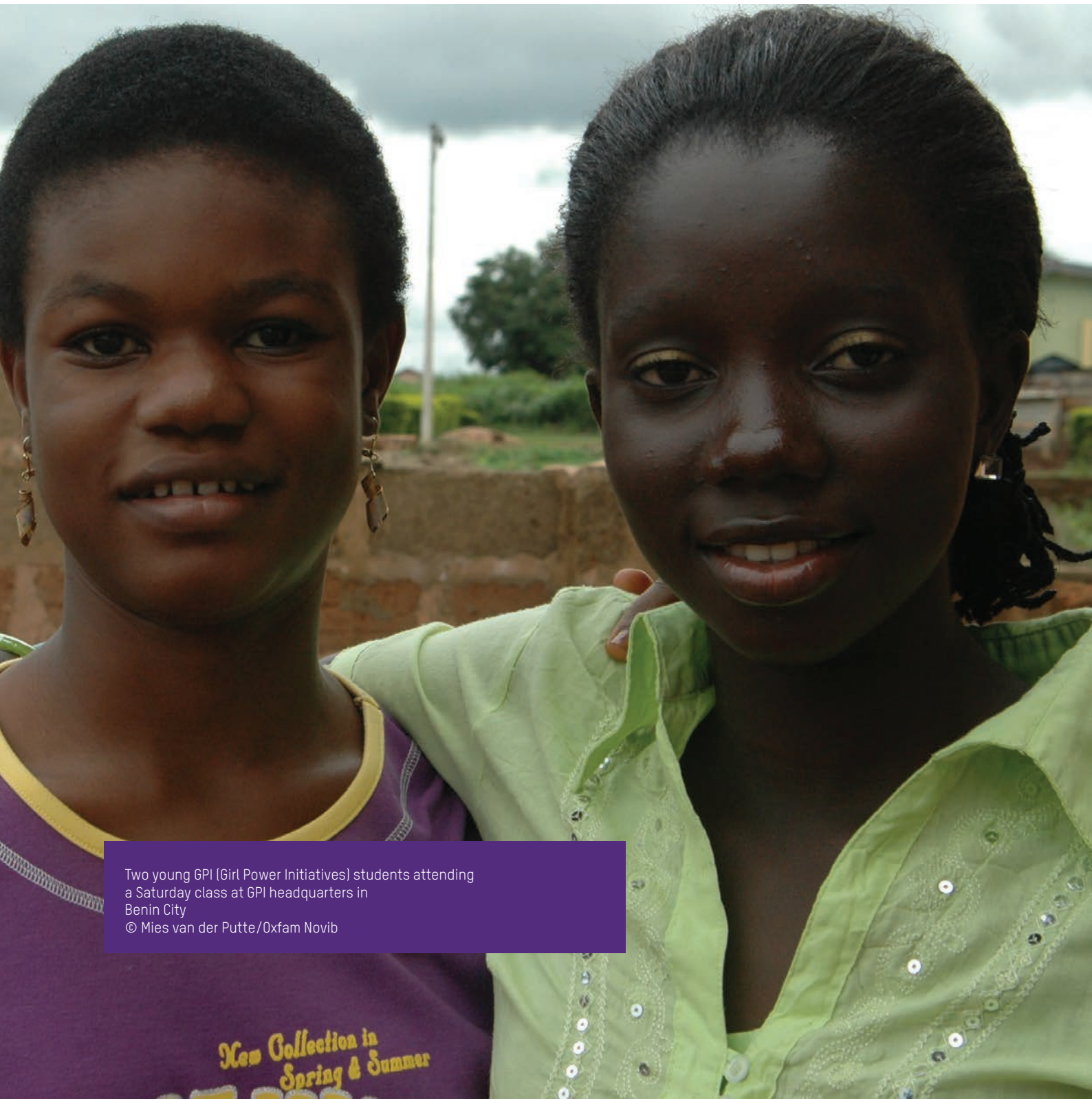
Two young GPI (Girl Power Initiatives) students attending a Saturday class at GPI headquarters in Benin City

tertiary institutions, female political aspirants selected from political parties and women who have retired from public service. These were trained and paired with experienced female politicians for mentoring purposes. Men were also targeted to involve them in value re-orientation and finding and sustaining solutions to the marginalization of women. A major challenge in the implementation of the program has been frictions and tensions among women's NGOs, which could constitute an obstacle to their effectiveness in promoting the interests of women in general and the agenda of female political participation in particular.