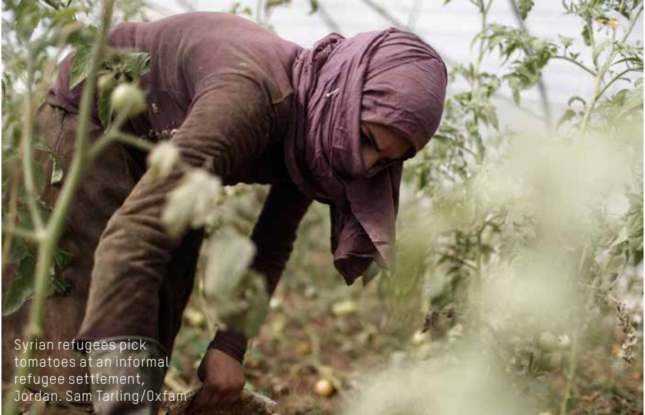
Syrian refugees pick tomatoes at an informal refugee settlement, Jordan.

If your organization has its own Responsible Data Policy, you may want to start by presenting that to participants.