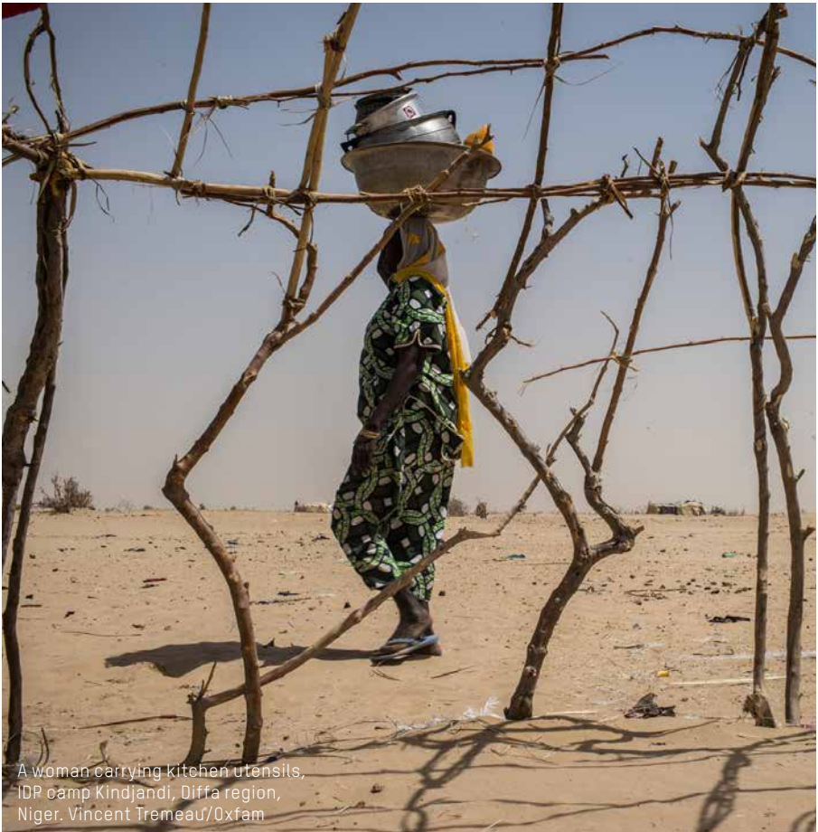
A woman carrying kitchen utensils, IDP camp Kindjandi, Diffa region, Niger.

Information Commissioners Office (ICO) https://ico.org.uk/