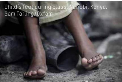
Child's feet during class, Nairobi, Kenya.

You are carrying out an assessment in a remote, conflict-affected community, in order to decide whether and how your organization might work there.