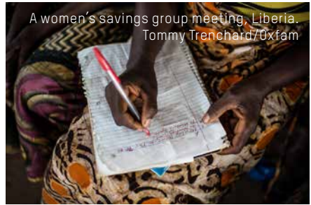
A women's savings group meeting, Liberia.

You are developing a system for monitoring the impact of an aid programme in a highly insecure location.