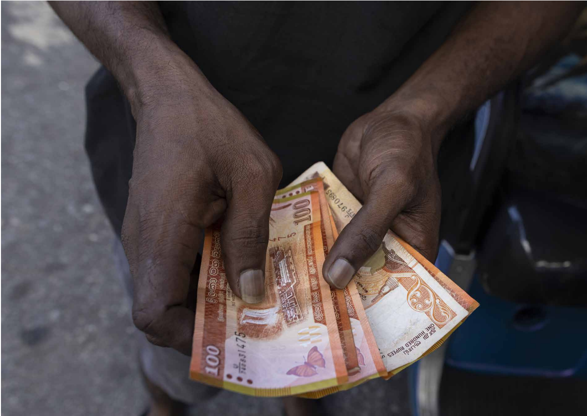
Wages in the Global South are between 87% and 95% lower than wages in the Global North for work of equal skill.

Global supply chains and export processing industries represent modern colonial systems of south–north wealth extraction. Workers in these supply chains frequently experience poor working conditions, a lack of collective bargaining rights, and minimal social protection. Wages in the Global