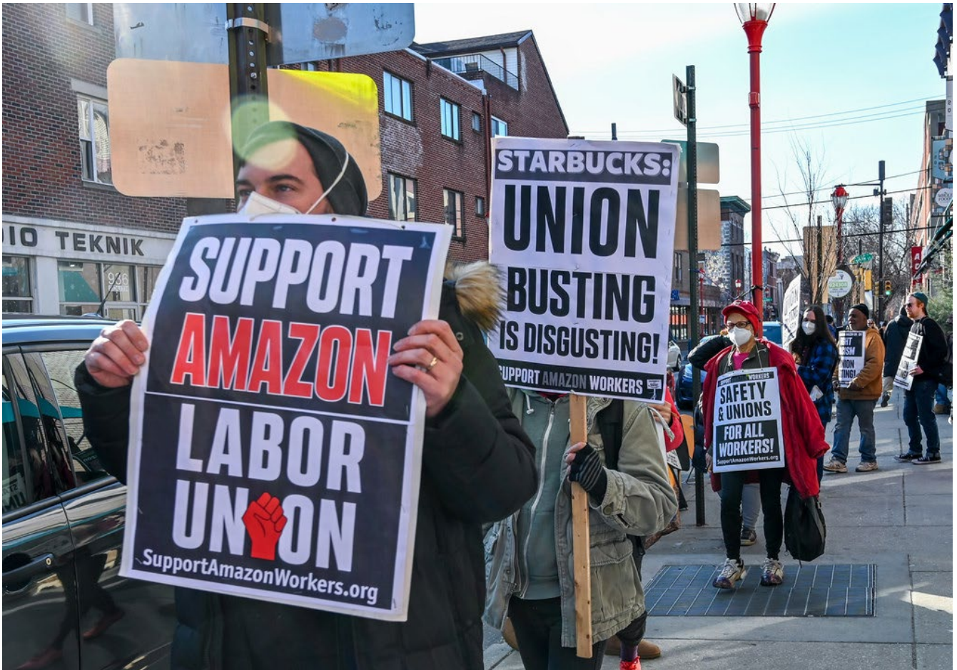
Workers campaigning for unionization in Philadelphia, USA.