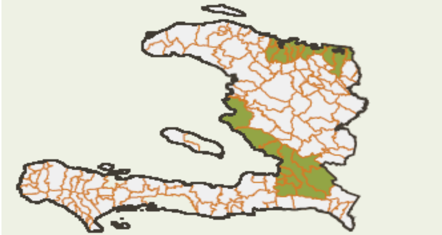
Figure 1. Haiti Feed the Future corridors (West and North)