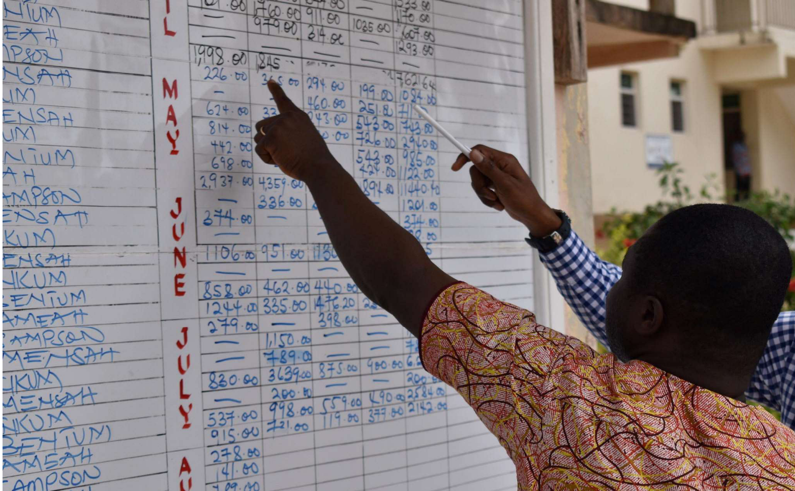
Photo: Oxfam staff review a public revenue and expenditure board in Shama, Ghana. (Andrew Bogrand).