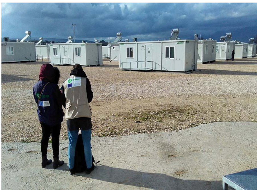
Oxfam enumerators conducting the endline survey at Katsikas camp in Epirus, Greece (March 2018).

There was general agreement among respondents that in the face of erosion of refugee law and denial of access to the asylum process, provision of legal aid assistance and combined advocacy on asylum are the most appropriate interventions to challenge policies and practices.