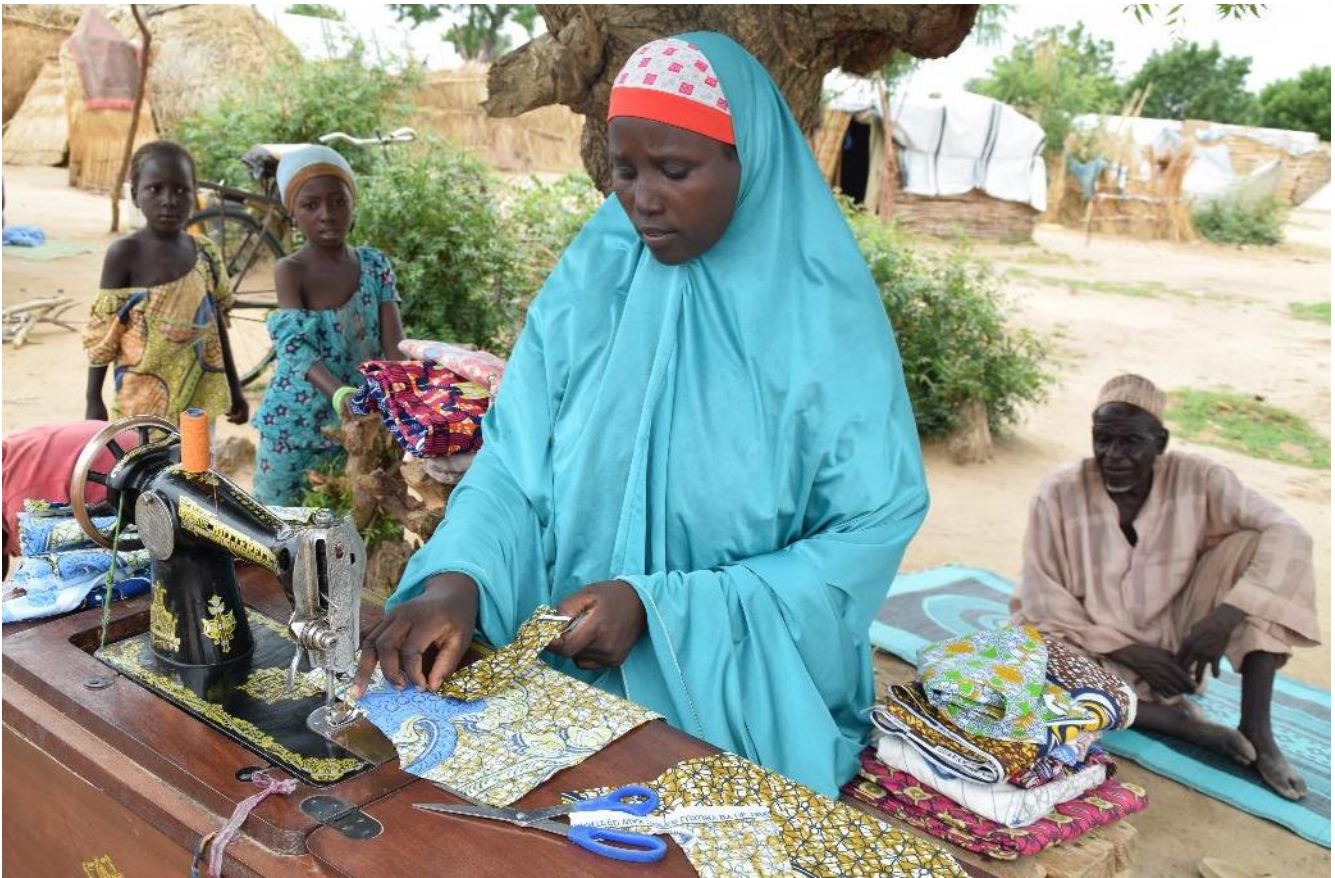
A displaced woman works with her sewing machine in an IDP camp in Damboa, Borno state, Nigeria.