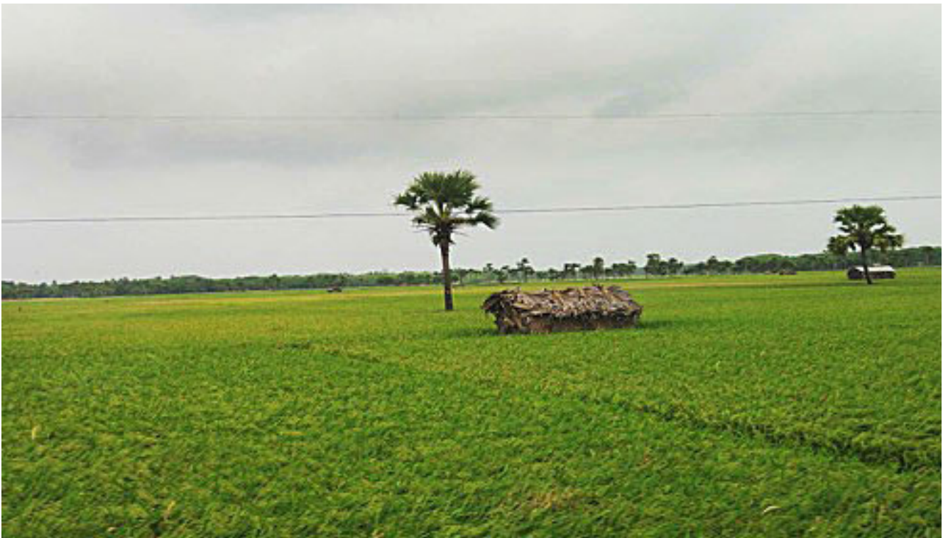
Power lines pass over a rural community without electricity access in Gaibandha District, Bangladesh.