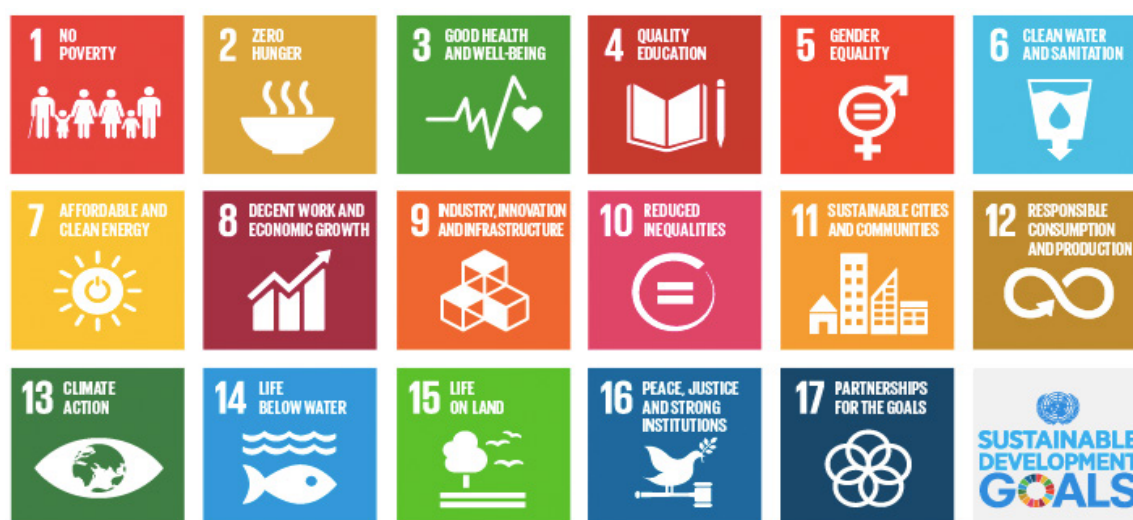
Figure 1: The Sustainable Development Goals