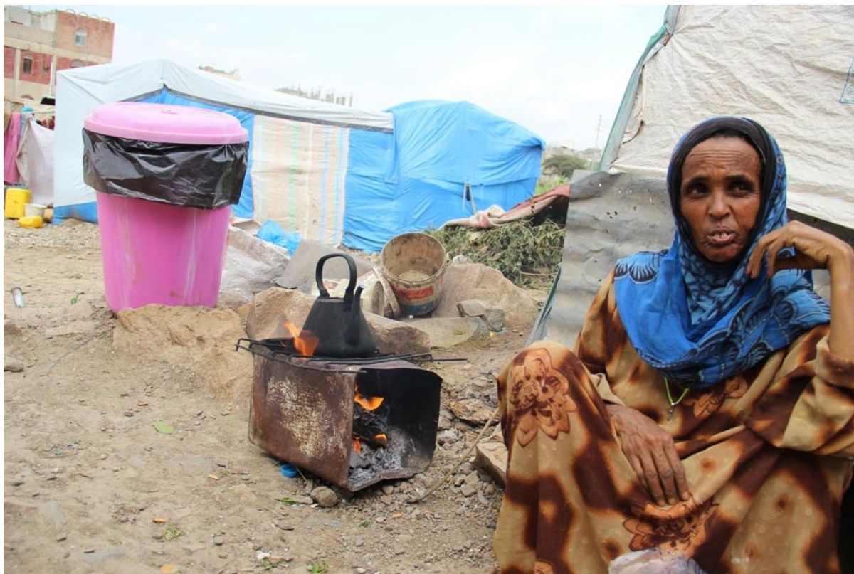
A woman makes tea in an IDP camp in Taiz governorate. For millions, tea and bread is often the only thing they have to eat.

The whole world must act now to avoid famine in Yemen, as two years of brutal conflict have led to what the UN describes as the worst humanitarian situation on the globe, with nearly 7 million people facing starvation.