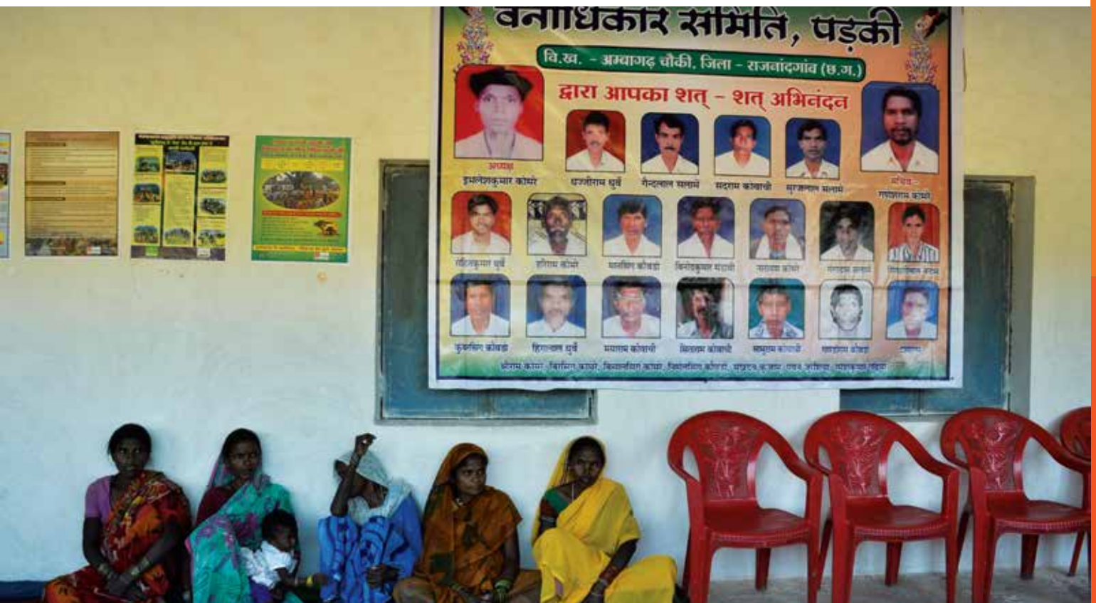
Though women are not yet members of the 4(1)(e) committee, at Padki village, they attend whenever they can. The women also don the role of Thengapalis to guard the forests

At Kongera Gram Panchayat's Junwani village, the resistance came from within the FRC. The Gram Sabha applied for CFR claim over 315.6 ha (780 acres) 16 of its forest, Kongera Dongri. Oxfam