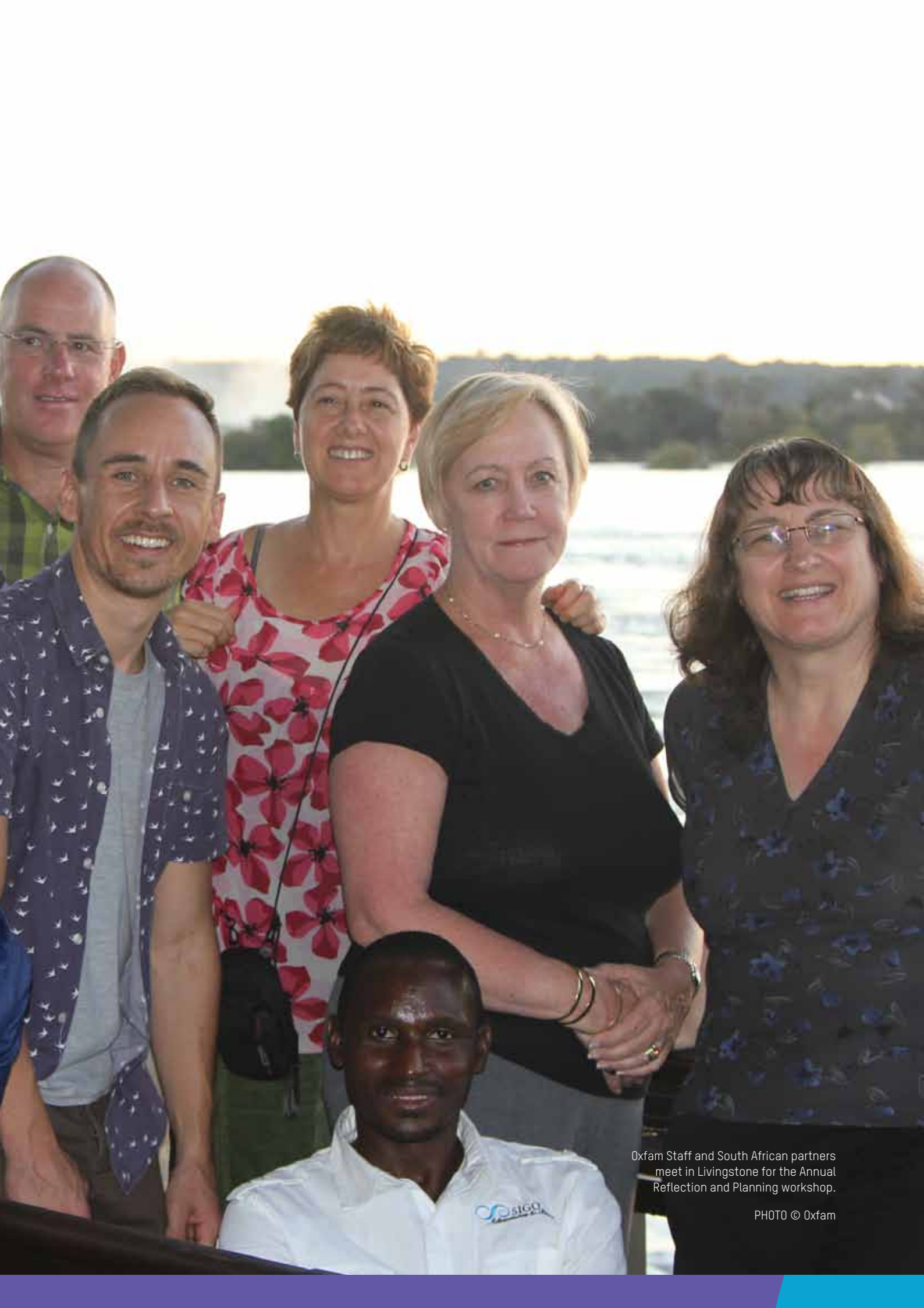
Oxfam Staff and South African partners meet in Livingstone for the Annual Reflection and Planning workshop.