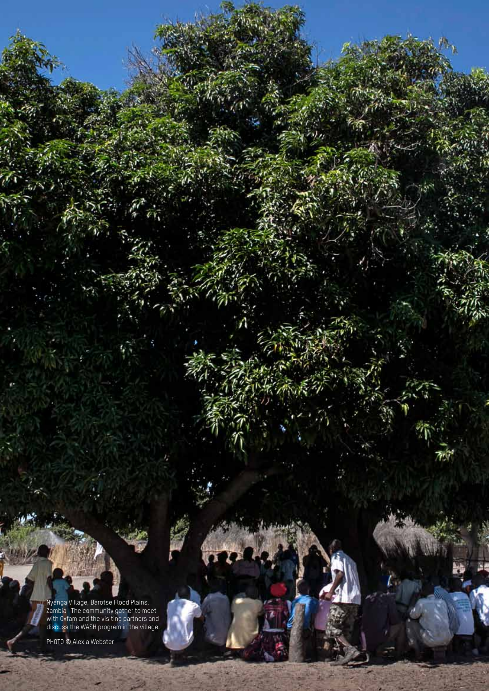
Nyanga Village, Barotse Flood Plains, Zambia- The community gather to meet with Oxfam and the visiting partners and discuss the WASH program in the village.