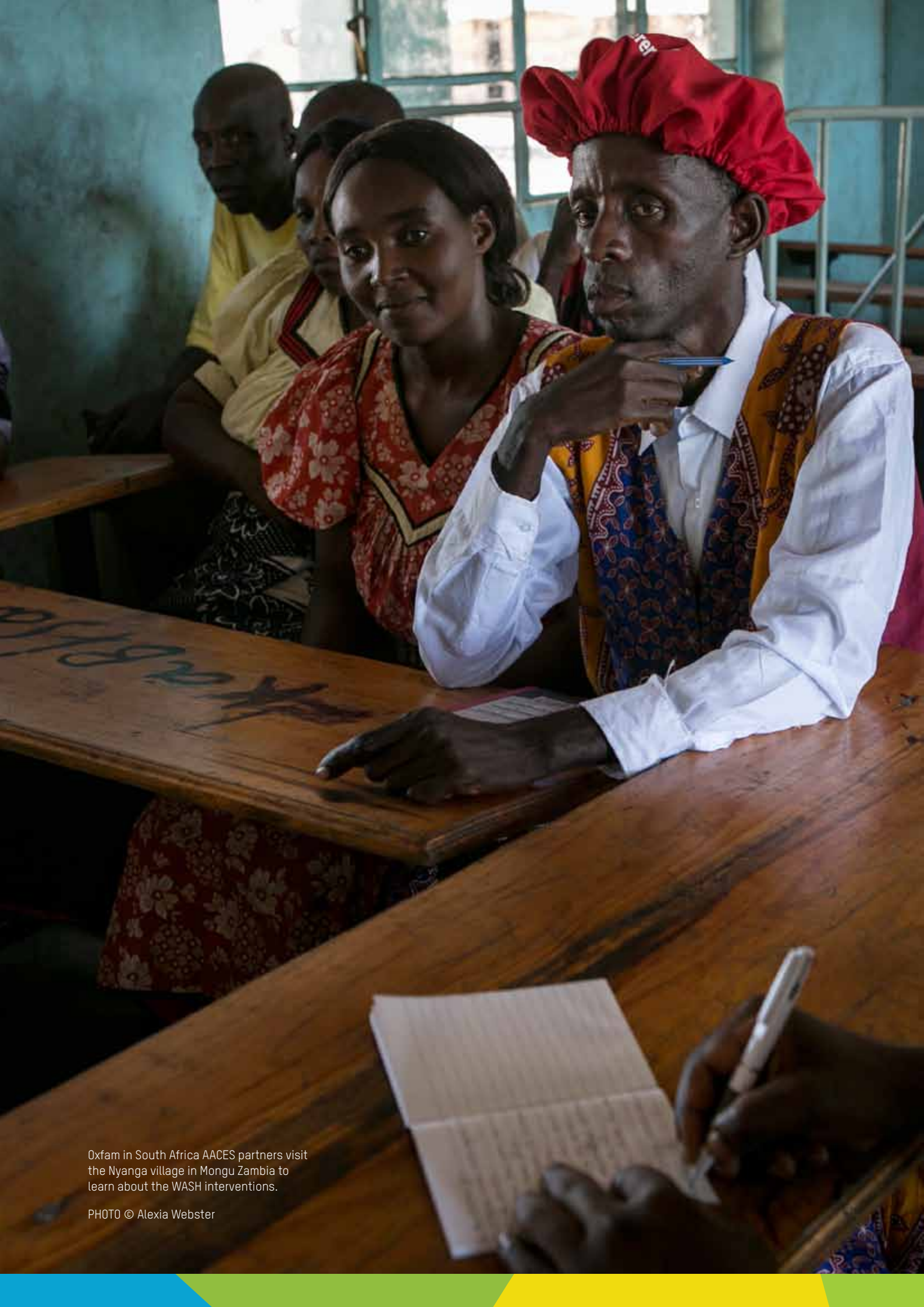
Oxfam in South Africa AACES partners visit the Nyanga village in Mongu Zambia to learn about the WASH interventions.