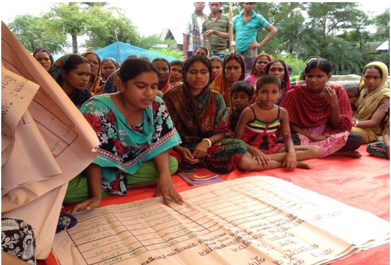
Women Crab Farmer Group meet in Southern Bangladesh