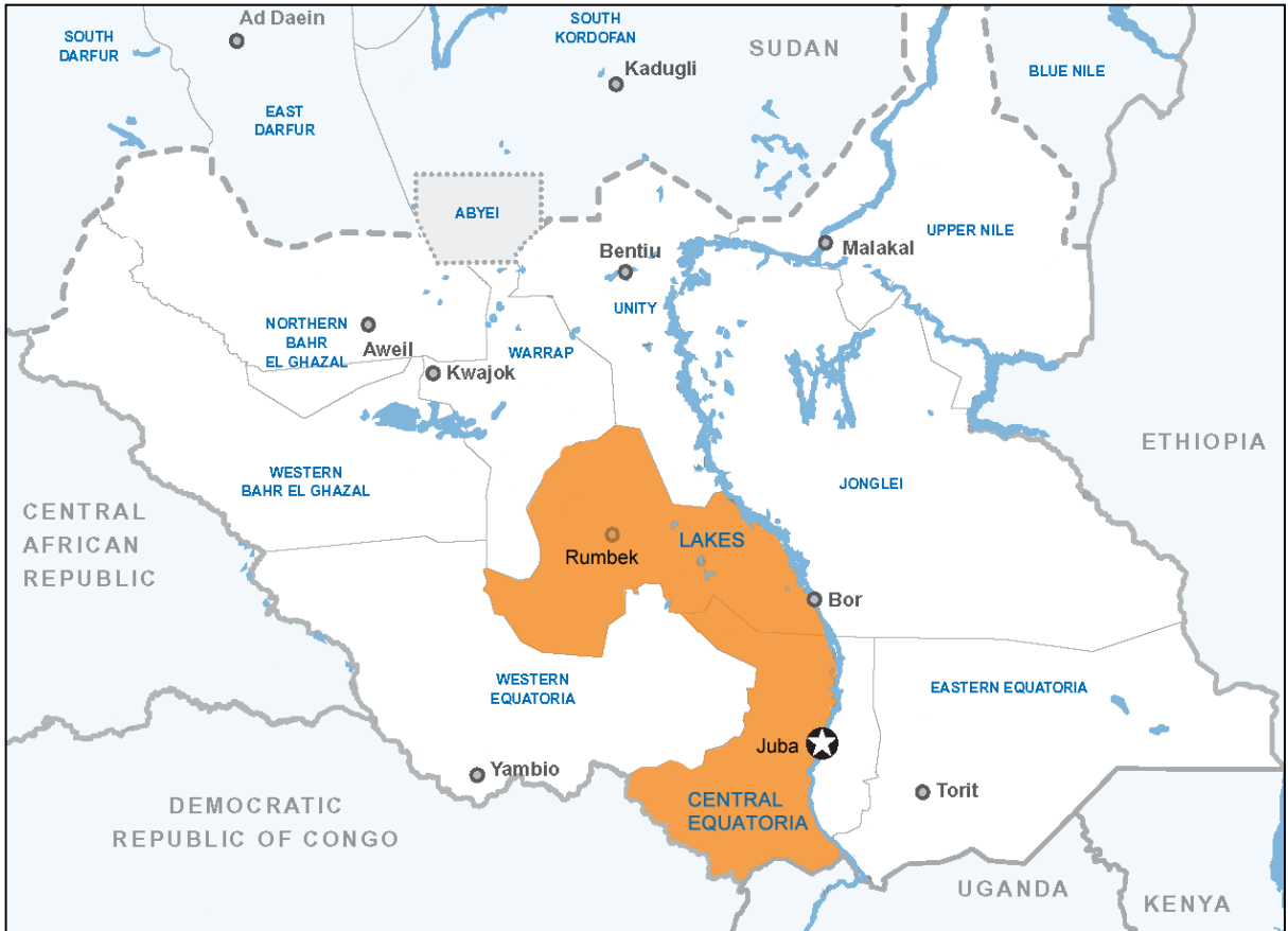
Figure 1: WWS works in Lakes State and Central Equatoria State, South Sudan (areas highlighted in orange)