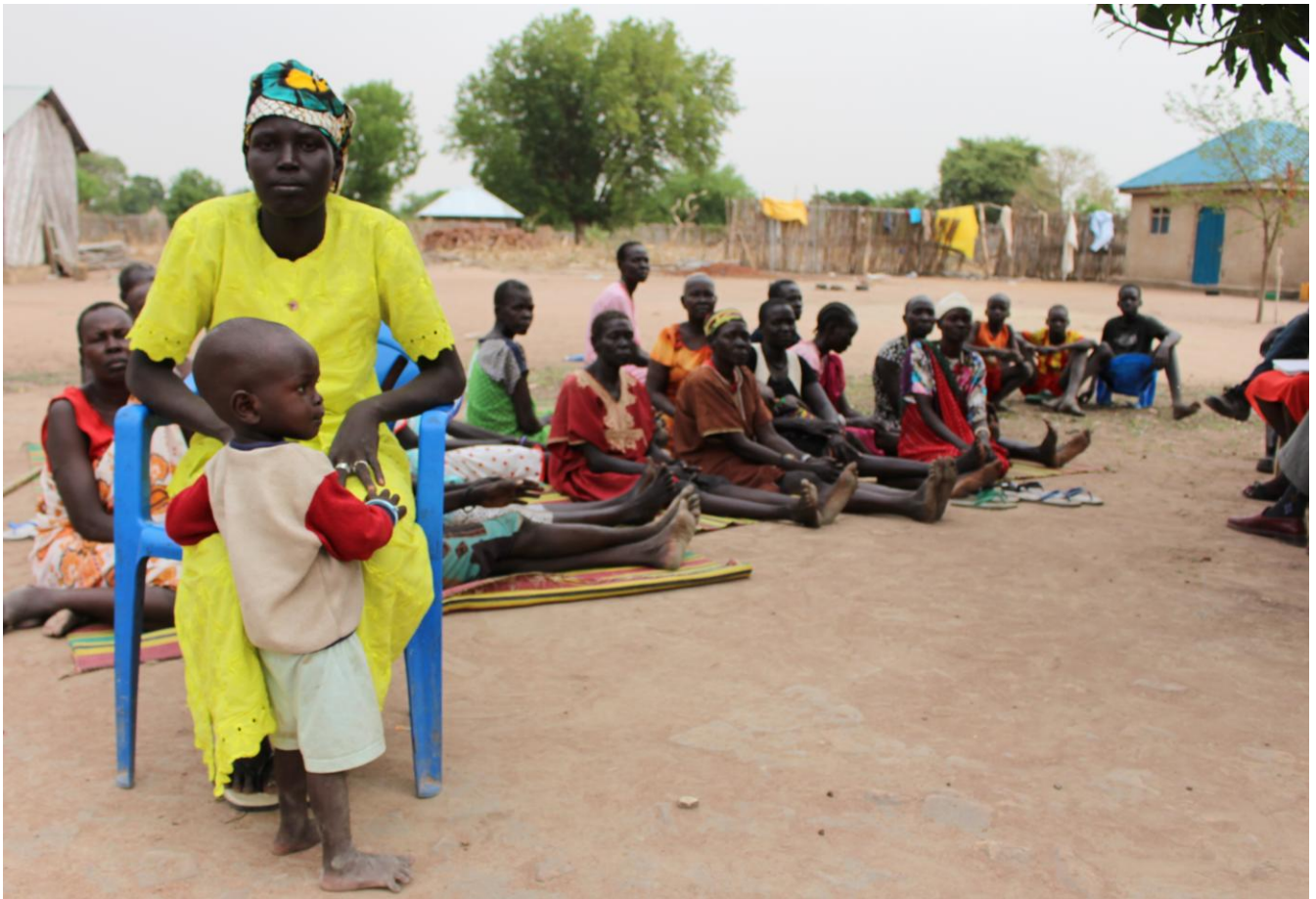
One of Within and Without the State's partner organizations: a women's cooperative group from Rumbek, who grow vegetables and meet to discuss community issues.