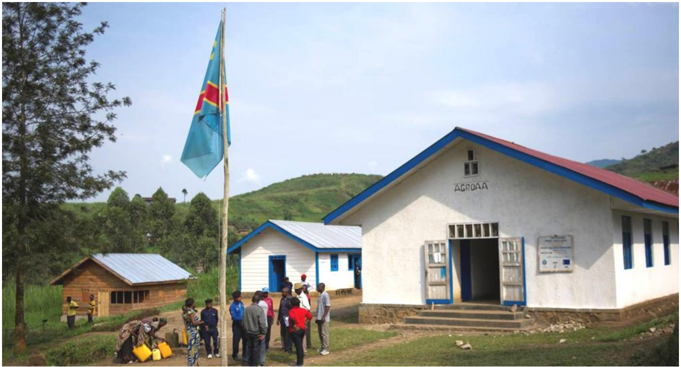
Local government office, Nyabiondo, Masisi territory, North Kivu.