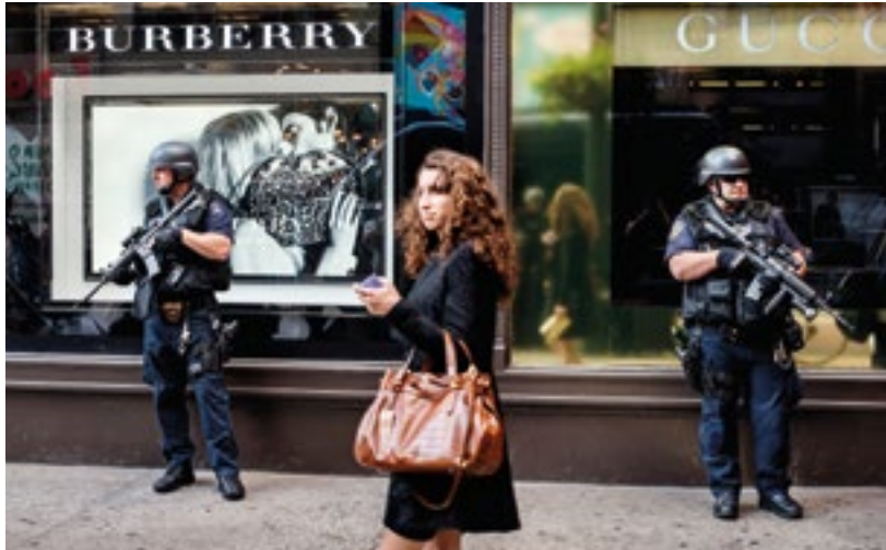
A woman walks past two heavily armed policemen on guard outside a department store in Manhattan (2008).

Homicide rates are almost four times higher in countries with extreme economic inequality than in more equal nations. 43 Latin America – the most unequal and insecure region in the world 44 – starkly illustrates this trend. 45 It has 41 of the world’s 50 most dangerous cities, 46 and saw a million murders take place between 2000 and 2010. 47 Unequal countries are dangerous places to live in.