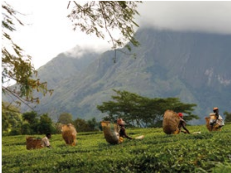
Tea picking in Mulanje, Southern Malawi (2009).

Maria lives in Malawi and works picking tea. Her wage is below the extreme poverty line of $1.25 per day at household level and she struggles to feed her two children, who are chronically malnourished. But things are starting to change. In January 2014, the Malawian government raised the minimum wage by approximately 24 percent. A coalition, led by Ethical Tea Partnership and Oxfam, is seeking new ways to make decent work sustainable in the longer term. 63