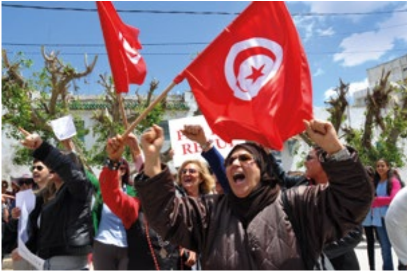
Women protesting at the Tunisian Constituent Assembly, demanding parity in election law, Tunisia (2014).

Today's extremes of inequality are bad for everyone. For the poorest people in society, whether they live in sub-Saharan Africa or the richest country in the world, the opportunity to emerge from poverty and live a dignified life is fundamentally blocked by extreme inequality.