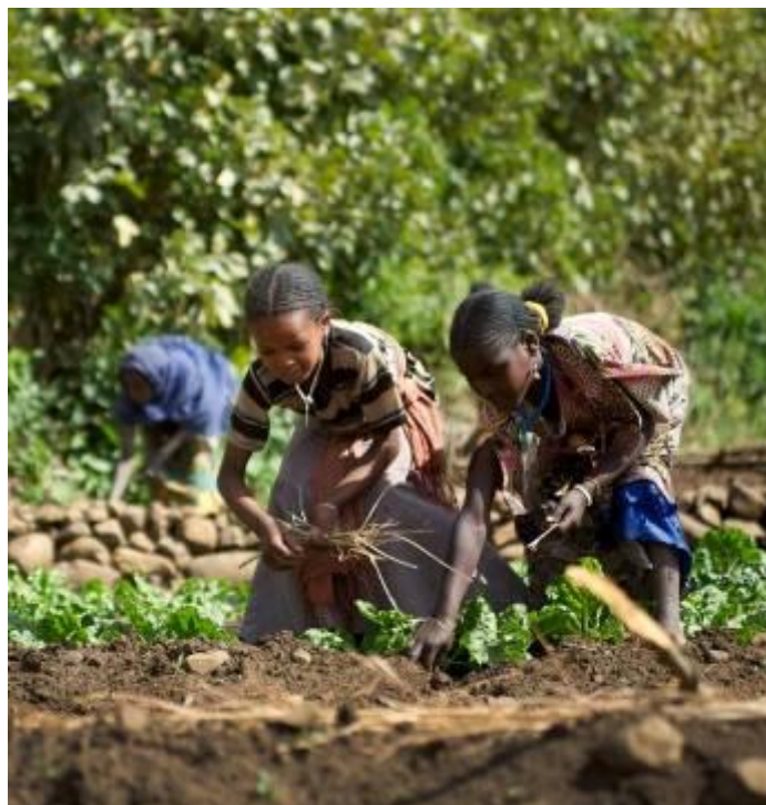
Girls supported by DRMFS and ACCRA's work in Gemechis woreda. Ethiopia

NGOs involved in local development were identified by local government as being important actors in the process. "They help us develop collection methods and collect data at the local level through logistic and financial support." But by the same token, local government is often unaware of the different NGOs working within their area, "We don't know who else is supporting the process or working at the local level in terms of civil society. It would be useful to have these actors mapped at the local level" . Another participant in the planning workshop commented that in his woreda "USAID and WFP have direct relationships with the woreda administrators based on food aid and food security issues. The woreda have some coordination and organisation but not much." The interconnection and coordination of organisations at the local level then takes on a special significance, and this can be used proactively to encourage engagement and awareness-building of how they can be brought in to support the process.