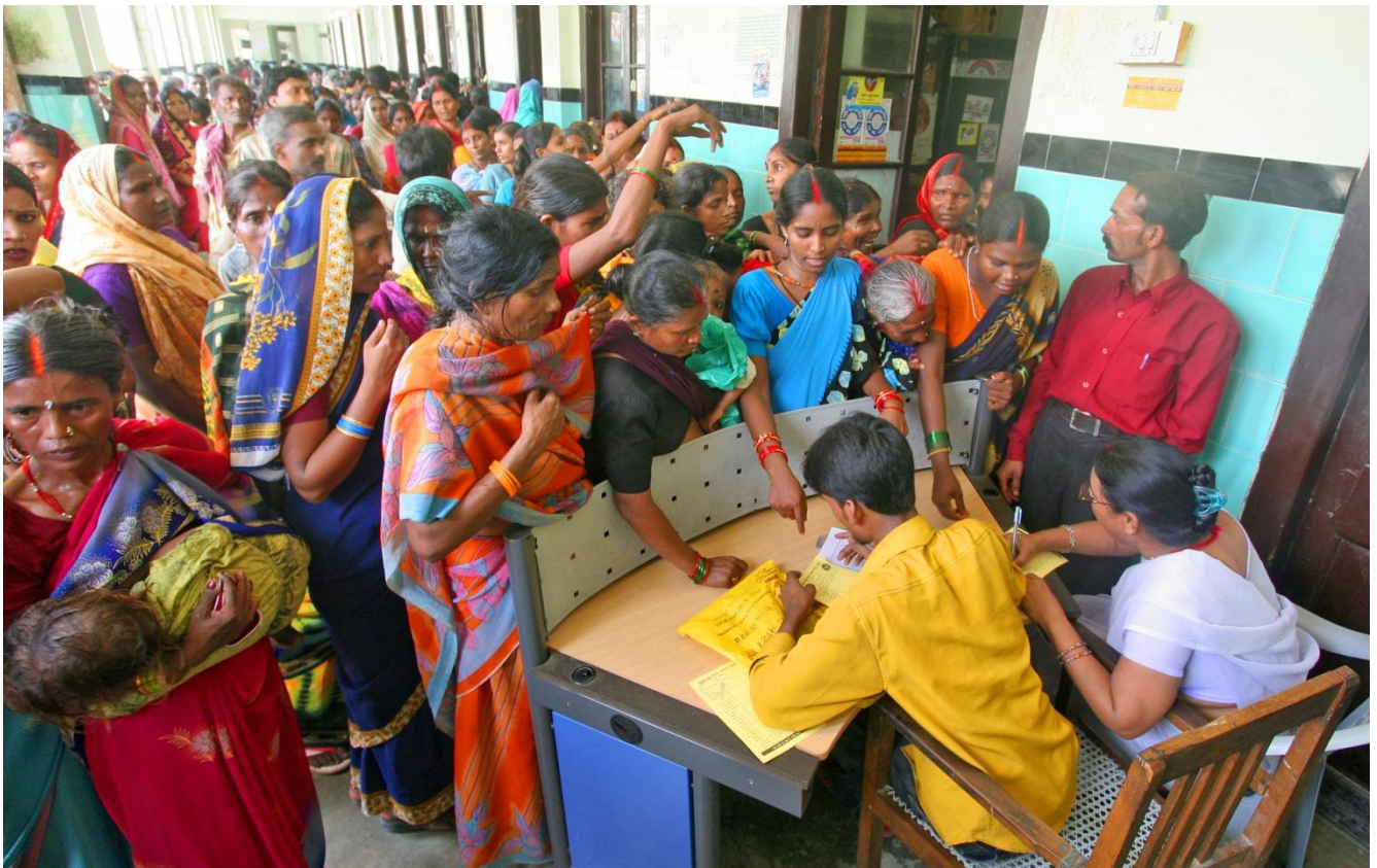
People waiting to get registered at Motihari District Government Hospital in East Champaran, Bihar, India. With so few doctors employed to work in the healthcare sector in India, this scene is typical. (2009)