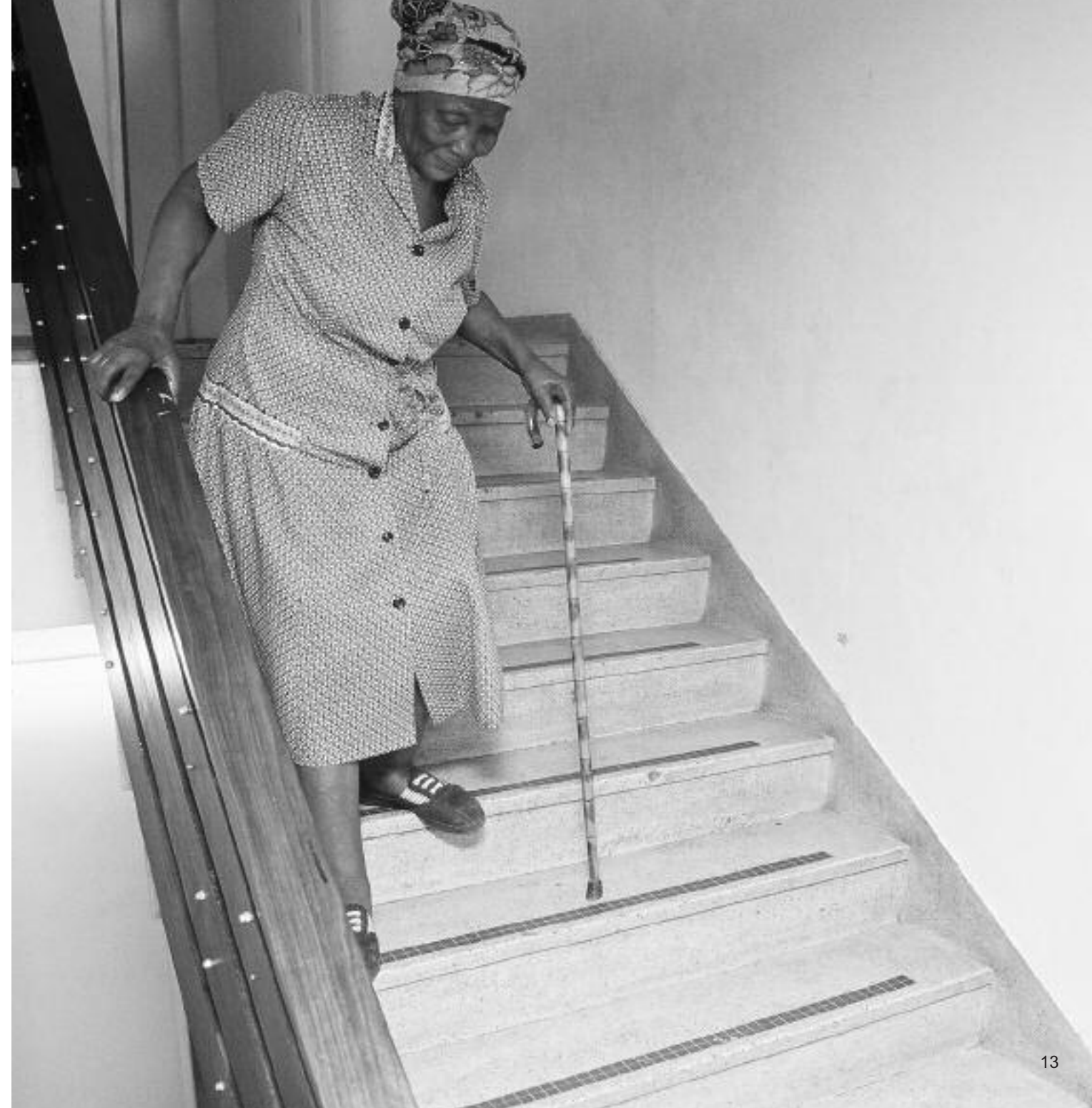
Photo: A Gogo coming down the stairs to the offices of LHR.

This is the first of a series of workshops and it is envisaged that workshops of this nature will be hosted nationally.