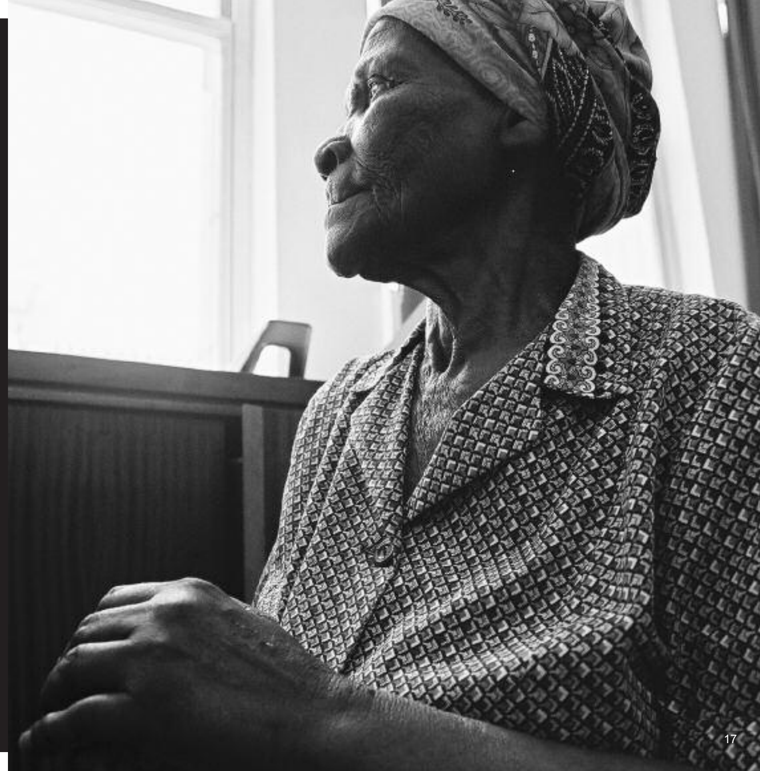
Photo: A portrait of a Gogo waiting.

Documenting these case studies has been a heart wrenching and enlightening experience for LHR. We often hear people proudly say that society has evolved over the centuries with modern equipment and technologies. But then one is lead to question the nature of a society where the elderly are left to fend for themselves.