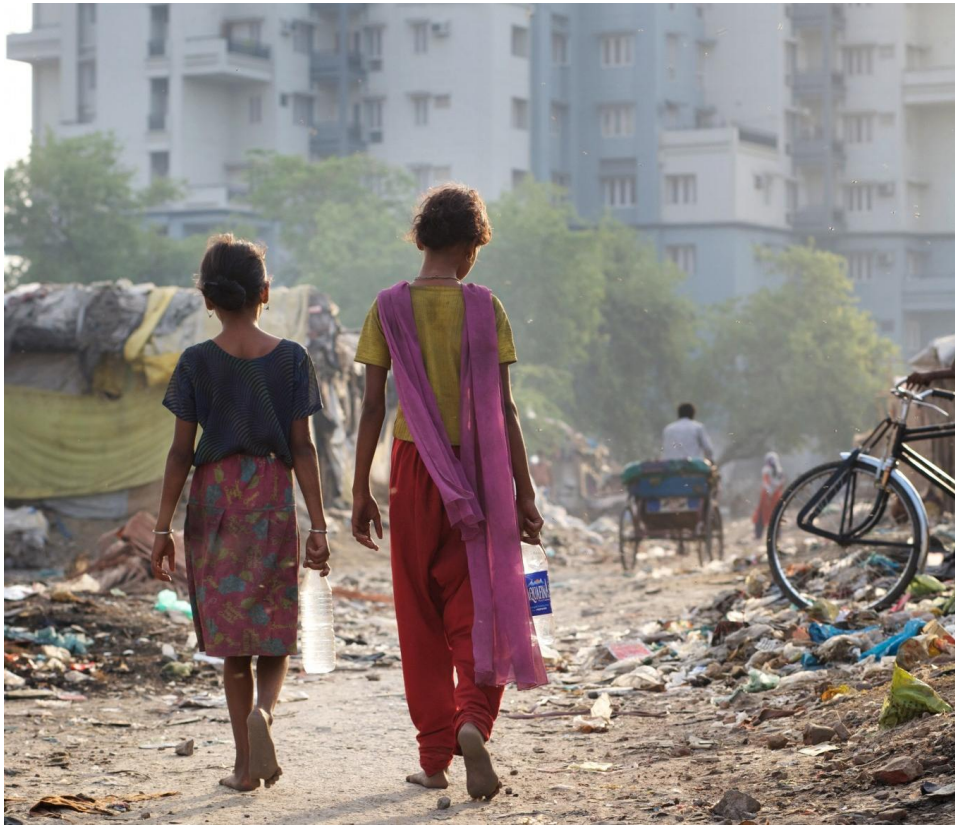
Housing for the wealthier middle classes rises above the insecure housing of a slum community in Lucknow, India.