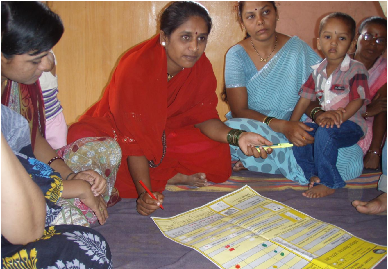
Villagers completing a community-based monitoring and evaluation report card in Bhor Block, Maharashtra state, India (2011).