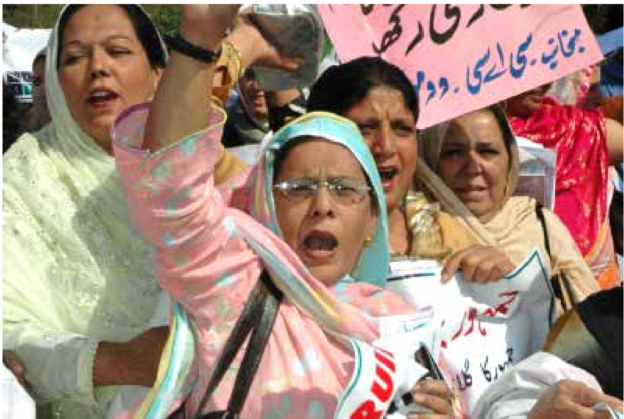
A 2010 PROTEST RALLY IN ISLAMABAD CO-ORDINATED BY THE WLGS AGAINST PROPOSALS TO AMEND WOMEN’S QUOTAS IN LOCAL GOVERNMENT.

AF explicitly chose to work with women of influence rather than the most marginalized. These women served as role models to catalyse personal transformation.