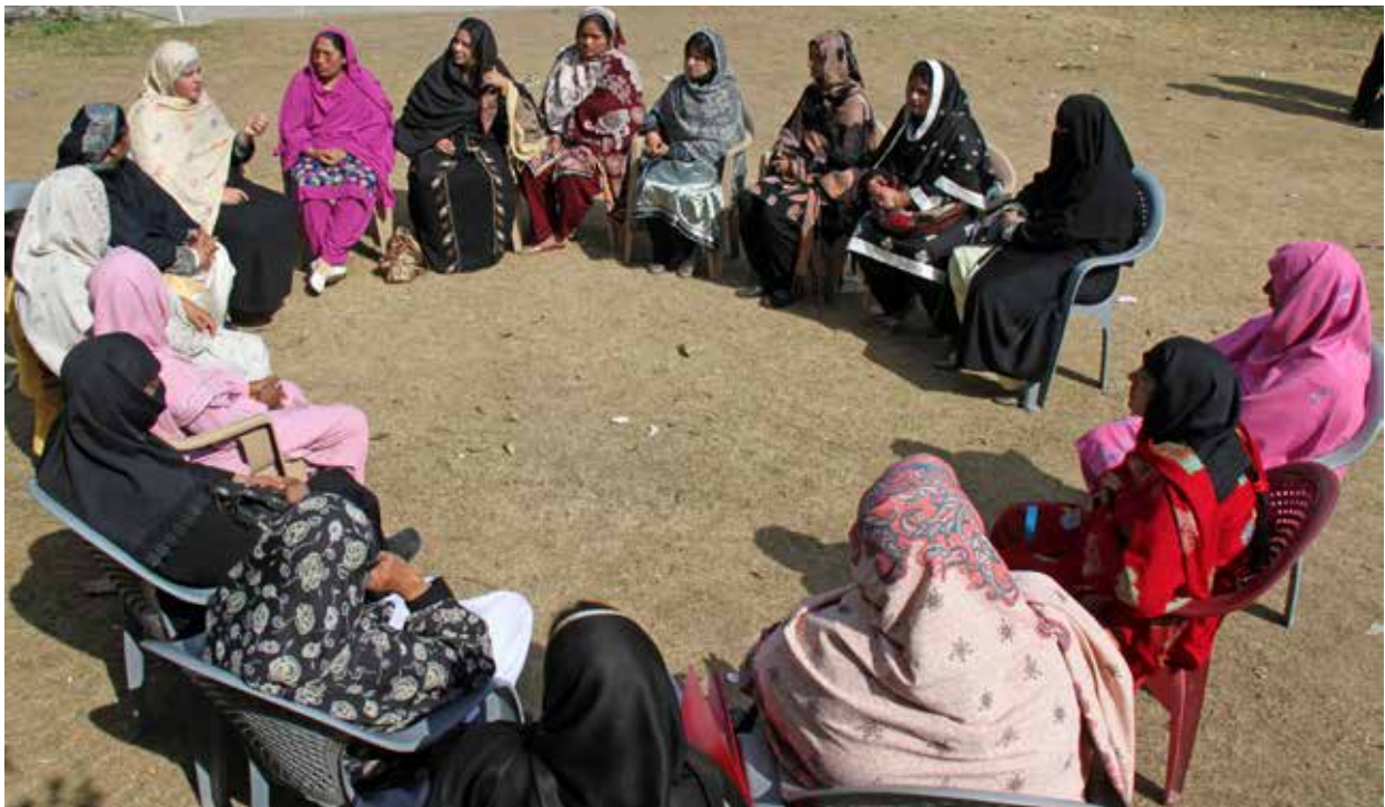
MONTHLY WLG ADVOCACY MEETING IN HAFIZABAD.

At the district and community level, WLGs have become powerful pressure groups. Whether advocating for the resolution of cases of sexual abuse in local schools, or custody rights and the right to a dowry after a marriage breakdown following physical abuse, WLGs have spoken out and taken action against injustice. Gaining strength and finding safety in numbers, they have challenged exclusively male arbitration bodies, such as panchayats and jirgas , 12 who traditionally decide the fate – and this can sometimes mean death – of women and girls in family disputes. Several district-level authorities now refer disputes and cases of violence to WLGs and CACs, who then refer them to lawyers. This ‘suggests something of a systemic change in some instances of dispute resolution.’ 13