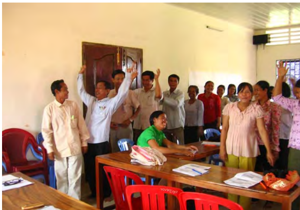
WPAN: A Training of Trainers session that includes men.

With CPWP gaining ground, it is actively working to recruit new members. One strategy is to recruit young women who then train each other and thus expand the reach and work of the network. The WPAN (Women's Political Activists Network) is and will continue to be instrumental in this. Materials have been developed for WPAN, and CPWP is looking to WPAN to take on educational activities.