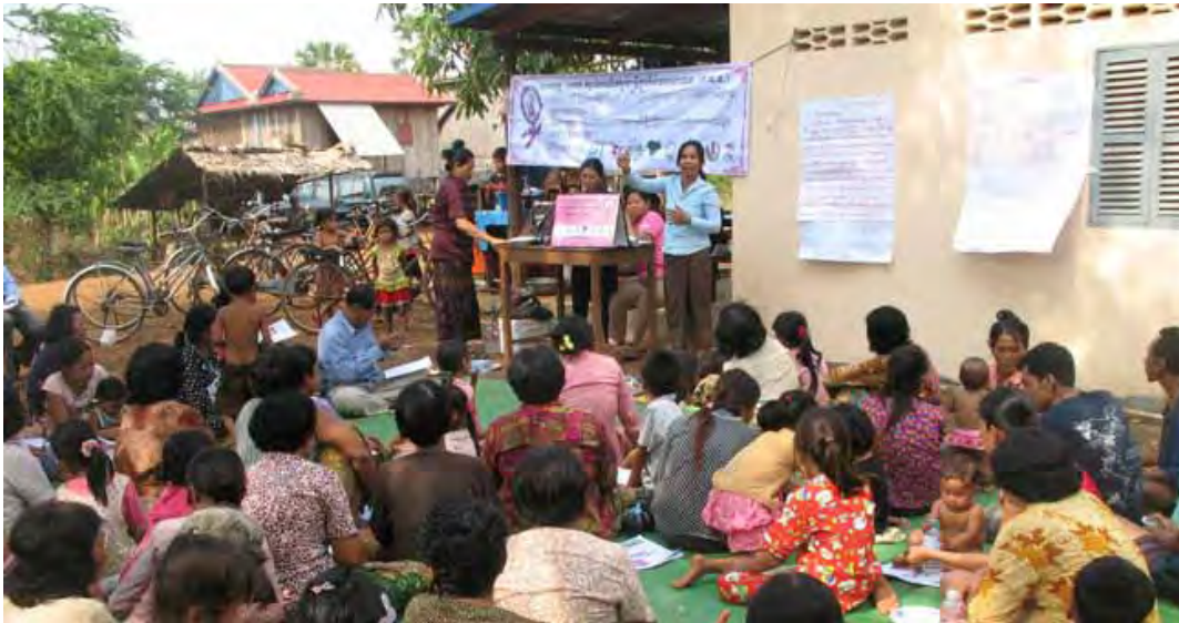
Working at the village level to change attitudes

CPWP trains women to enter politics at three levels: commune/sangkat, district and provincial.