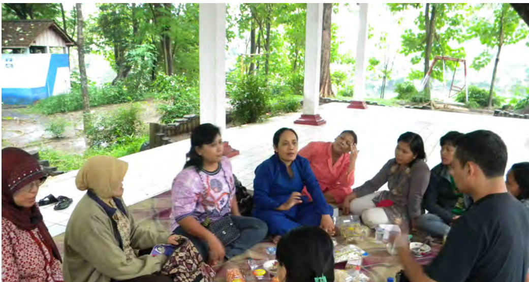
ASPPUK provides support to its member organisations

Apart from its work with the CSO network to empower women economically, ASPPUK also advocates for gender equity, gender justice and women's leadership at the political level. Its starting point is that political awareness and economic development are both necessary for gender justice. ASPPUK runs training on community organisation, political awareness, political rights, and critical awareness. It also has a Women's Empowerment in Politics programme which carries out voter education at the village level in preparation for elections.