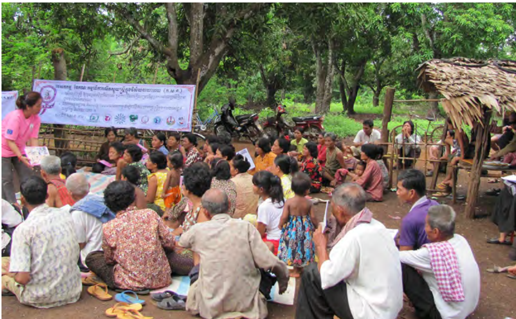
Outreach to villages

Nothing will change for women and girls without attitudinal change. People are starting to recognise that all women play an important role in society and that policies need to respond to the basic rights and needs of women and children. CPWP reaches out to men, women and the wider public through its media and community outreach programme.