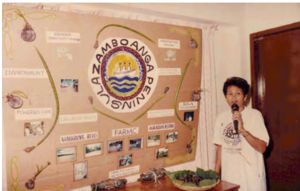
Area Reporting by women leaders

AADC is optimistic that gender equality will be achieved in our lifetime. The younger generation is changing, partly because of pressure from their peers, but also because of their parents' increasing awareness. For the first time, significantly, boys are learning to do household tasks. The younger generation is seeing more women in leadership roles in organisations, the political arena and in higher education; and they see women asserting their rights. Education is crucial in this, and AADC is working on having gender principles mainstreamed in the education system so that this will continue into the future.