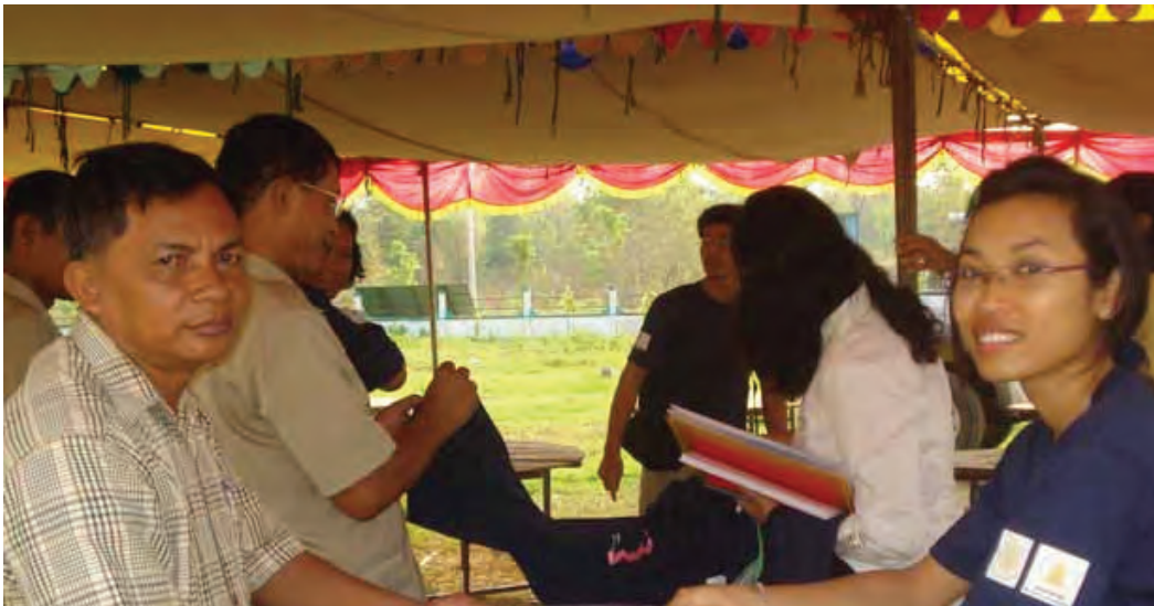
Women's Rights Day 6