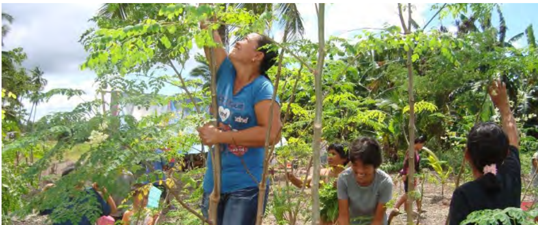
Earning an income is an important step towards placing women in leadership roles.

A new approach to achieving gender equity and women’s empowerment is to educate men. One of the new activities designed to achieve this goal is the ‘family days’. Every member of the family is welcome, and they can take part in various activities. Among the activities are support groups to discuss issues at the household level. When men see that other men support their wives and kids, they are encouraged to do likewise.