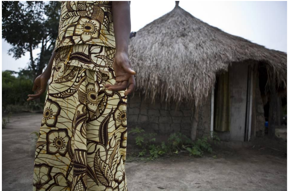
One of the 1.7 million displaced people in DRC in front of her home at an IDP camp in Province Orientale.

Each year Oxfam undertakes a far-reaching survey of unheard, conflict-affected people in eastern Democratic Republic of Congo. Three-quarters of the 1,705 people polled in 2011 said that they felt their security had not improved since last year. In areas affected by the Lord's Resistance Army (LRA), this figure rose to 90 per cent, with communities telling Oxfam that they felt abandoned, isolated, and vulnerable. Communities everywhere painted a grim picture of continued abuse of power by militias, the Congolese army, and other government authorities, wearing away their livelihoods and ability to cope.