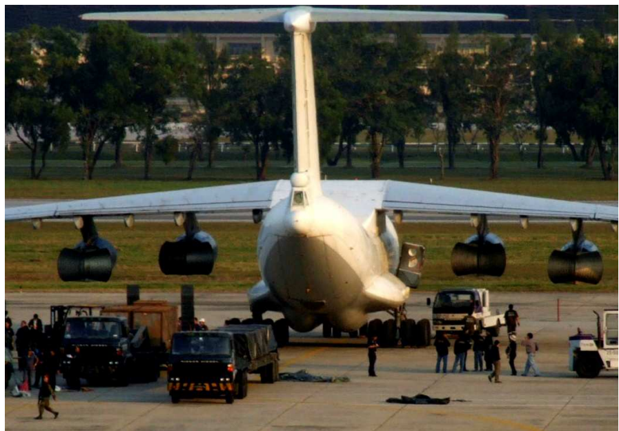
Thai police officers and soldiers surround the cargo plane at Don Muang Airport in Bangkok, Thailand, 12 December, 2009.

There are many unanswered questions surrounding the final destination of the cargo. Iran is declared on the packing list as the final destination, 51 yet it still remains unclear if this is where the North Korean arms were due to be unloaded. A 2010 United States Congressional Research Report highlights that 'between 1998 and 2001, North Korea is estimated to have exported some $1 billion in conventional arms to developing nations'. 52 A more recent estimate by the Institute for Foreign Policy Analysis puts North Korean weapons sales at $1.5 billion per annum. 53