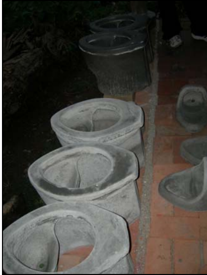
Fig 9: UD Pedestal toilet manufacture in Mexico.

Choosing hardware that meets the needs and cultural preferences (i.e. seated, squatting, wet or dry anal cleansing) of users is key in terms of technology acceptance.