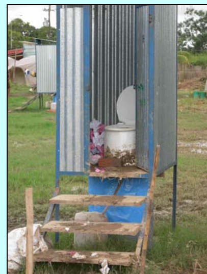
Fig 6: Management problems with used toilet paper

The UD design itself is innovative, as it can be set up quickly, and separates urine from faeces. Urine is drained to a container, while the faeces are collected in a 200-litre drum lined with a bin liner. The local authorities are then responsible for collecting the faeces filled bags on a daily basis. Bags are then disposed of at a landfill after collection by truck. Separating the faeces from the urine facilitates the handling of the two human waste streams. The collection & disposal system does work, but experiences from Bolivia highlighted the local authorities need to provide a reliable O&M service. The awareness of users also needs to be raised, particularly in relation to good hygienic practices.