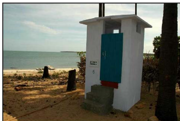
Fig 8: Complete twin vault UD latrine, Sri Lanka