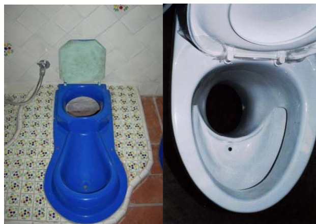
Fig 1: UD Squatting plate

which is used to store and dry the faeces over a specified period. Normally, it is recommended to store faeces for a minimum of 12-months in one vault before emptying. Adding a desiccating material such as ash or sawdust will accelerate the faeces drying process. Typically, in a well-managed ecosan unit, storage times of greater than 3-months will reduce many pathogens to safe levels, in particular those responsible for Ameobiasis, Giardiasis, Hepatitis A, Hookworm, Whipworm, Threadworm, Rotavirus, Cholera, Escherichia coli, and Typhoid amongst others. Ascaris is more persistent though, and may require retention times of 12-months or more.