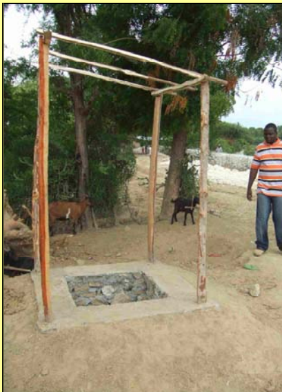
Fig 4: An Arborloo under construction