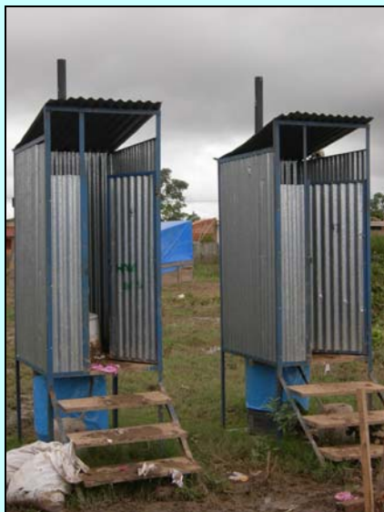
Fig 5: UD Communal Toilet, Bolivia

The units installed on the embankments were set up close to those displaced, and came from a local authority contingency stock (from 2007 floods).