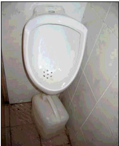
Fig 10: Urinal and container

Choosing hardware that meets the needs and cultural preferences (i.e. seated, squatting, wet or dry anal cleansing) of users is key in terms of technology acceptance.