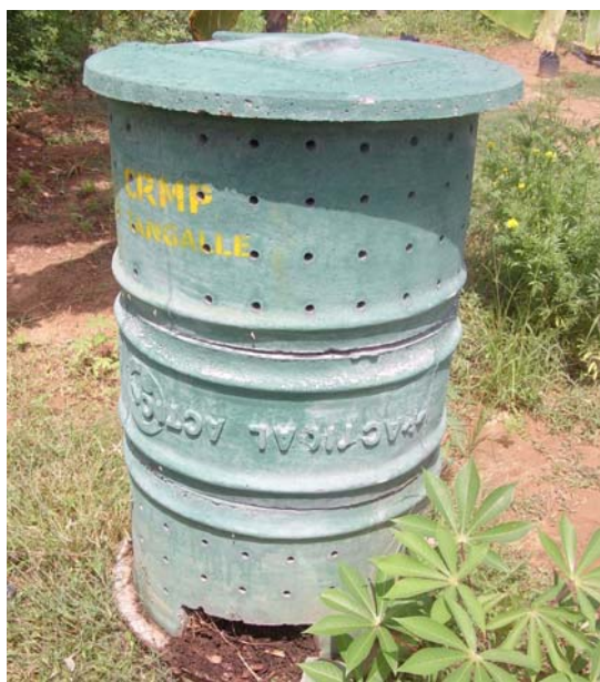
Figure 1: Post tsunami compost bins, Sri Lanka

One of the main problems with compost bins is that it can take a considerable period of time for the composting to take place (up to a year). Also restrictions in the amount of air in the system can lead to anaerobic conditions, which can create bad odours and attract flies and vermin. The most appropriate way of dealing with this is to turn the compost on a regular basis – initially twice a week to start with, but if the composting is drying out - less frequently. If the compost becomes smelly, – then turn more frequently. It may be more practical to cover fresh waste with a lid, which will reduce access to the compost by vermin as well as keeping out excessive rainwater, especially in a tropical climate. In an arid environment, a lid will help to stop the compost drying out.