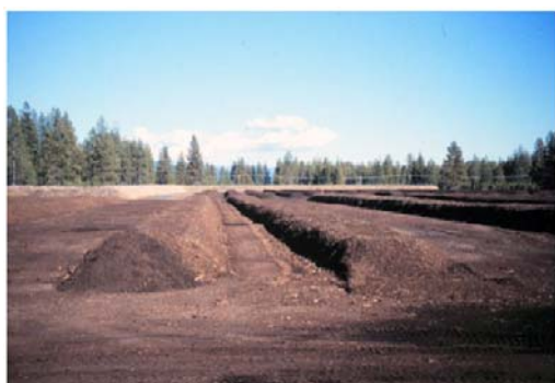
Figure 2: An Example of Windrow Composting in UK

Consideration should be given to the surface upon which the composting takes place. Ideally composting should take place on a concrete base and cut-off drains around edges to capture leachate/run-off (from rain) to avoid environmental degradation of the surrounding area, watercourses and ground water. Leachate can be captured and re-added to compost during the turning process to add moisture to the pile if drying is an issue.