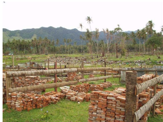
Figure 2: Recycled Bricks Collected by the Local Community following the Asian tsunami in Banda Aceh, Indonesia.

To enable recycling and composting to take place successfully, communities will need understanding why it is important to separate waste and how they can do this in a practical way. The role of the public health promotion team will be crucial in understanding current practices, and in raising awareness of new issues related to better waste management practices. The roles of men, women and children in any potential recycling and composting activities should also be analysed, as these are likely to have a big impact on potential outputs.