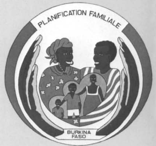
Family planning sign in Gaoua, near Bobo-Dioulasso.

In recent years an international campaign to eradicate river blindness in Burkina and the surrounding region has opened up new fertile lands in the south west of the country for migrants from the drought-stricken Sahel. Yet as these migratory flows continue and shift, the most acute pressure in the coming generation seems certain to be on the towns and cities. Twenty years ago the capital, Ouagadougou, was a modest mudbrick town of 100,000 souls. At the start of the 1990s it is home to half a million, and in a mere 20 years more it is expected to reach 1,550,000.