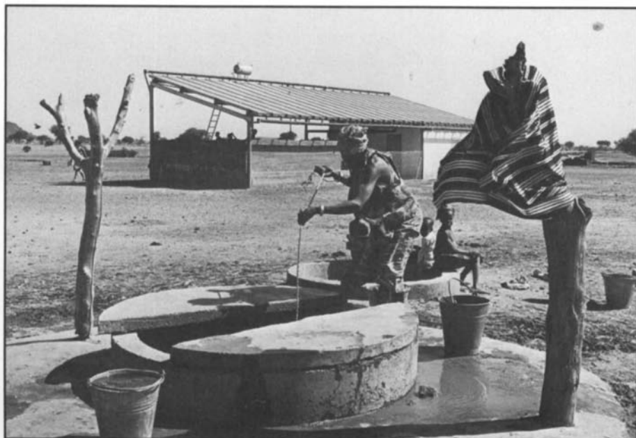
In the background: a solar-powered pump, paid for by the European Community. It fails to supply enough water, so the traditional well in the foreground, which it was meant to replace, is still in use.