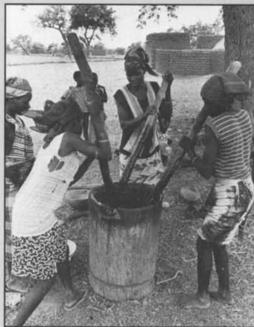
Women pounding karité nuts to make shea nut butter, Noogo village, Yatenga province.