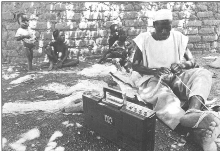
Goumba village, Yatenga province: listening to the radio while making rope from the threads of nylon sacks.

Apart from Sidwaya , there is one newspaper in the main national language, Mooré, which appears a few times a year. But the print media reach only one person in 5,000, whereas almost every family by now has a transistor radio. The national radio service broadcasts 100 hours a week, but more than half of its output is in French — understood by only a small proportion of the population — while 16 national languages get an average of no more than three hours each. Community groups are now at least getting better access to the airwaves of the Rural Radio Service, which broadcasts village debates, music and entertainment, and programmes for women. Thursday is the day for rural radio broadcasts in Burkina, and, in the words of one of its presenters, Seydou Drame, 'The farmer gets on his bicycle and rides off to his field with a hoe, some water, and his radio, to keep him company while he works. It's up to us to keep him interested, because if he gets bored he can turn to Radio Mali, Radio Benin, or Africa 1. By giving people access to the airwaves themselves, we're discovering the need for a peasant-to-peasant dialogue.' The first two of six local radio stations are also in operation, funded by their local communities and with technical support but no finance from central government.