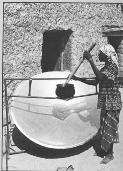
A solar-powered cooker, designed and made in Europe - without much reference to local needs: village women cook in the evenings, not at mid-day (when most heat is produced); and the pot is too small for a family meal.

By the end of 1987, when the project was supposed to wind up, very little had been achieved. It had 'reached' more than the 8,000 farmers originally planned, but basically they weren't much interested. Fewer than 10 per cent of them had received the credits they were supposed to get to buy agricultural inputs, equipment and farm animals. Anti-erosion works covered less than half the original target area, none of the four planned