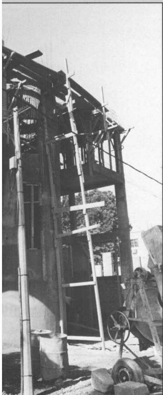
A common sight in Ouagadougou's commercial zone.

The nagging question, however, is whether such an undeveloped agricultural country can really afford all this expensive centralised infrastructure. It's true that until recently Burkina has indulged less in extravagant construction projects than many other African countries — and that a sizeable chunk of current building investment is said to come from individual Burkinabès who have been accumulating funds in Ivory Coast. Nevertheless, the extent of government financing of the building boom begins to look disproportionate when only a small proportion of foreign aid, and less than five per cent of the government's own budget, is devoted to the agriculture on which four-fifths of its people depend.