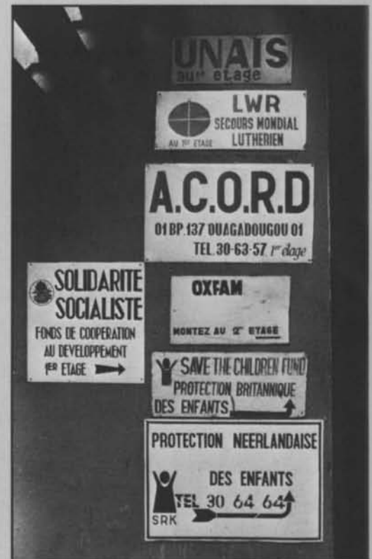
A few of the 70 foreign development agencies based in Ouagadougou share an office block with Oxfam.

Working on similar lines is the Groupe de Recherche et d'Appui pour l'Autopromotion Paysanne (GRAAP), established by the Dominican order and likewise based in Bobo Dioulasso. And then there is the Federation of the Groupements Naam , which is not only an autonomous national movement but has also an authentic social base, with 200,000 peasants linked to it.