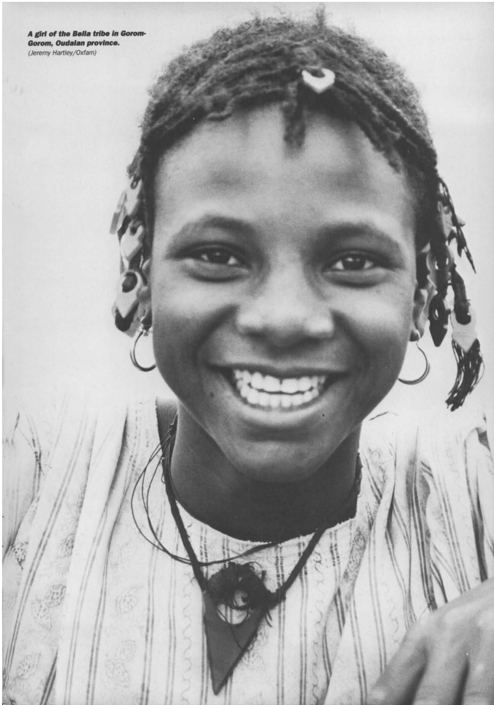
A girl of the Bella tribe in Gorom- Gorom, Oudalan province.