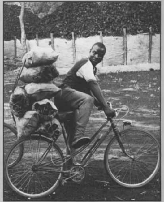
Buying charcoal from the government-controlled store in Ouagadougou. One sack costs £1.30. The wood comes from Kompienga, on the Togo border; only licensed traders can sell it.

There are, however, other questions about the viability and the environmental impact of large dam projects. Fisheries in the dams of Lake Volta, Ghana, and Lake Kariba, Zambia, started off with impressive catches, but later declined rapidly as lake vegetation rotted away and fish stocks fell. Elsewhere, problems of salinity and waterlogging on irrigated land have drastically reduced agricultural productivity, while large dams have proved good breeding grounds for the black fly which carries the worm causing river blindness. The problems likely to arise with Burkina's hydro-power programme are still incubating.