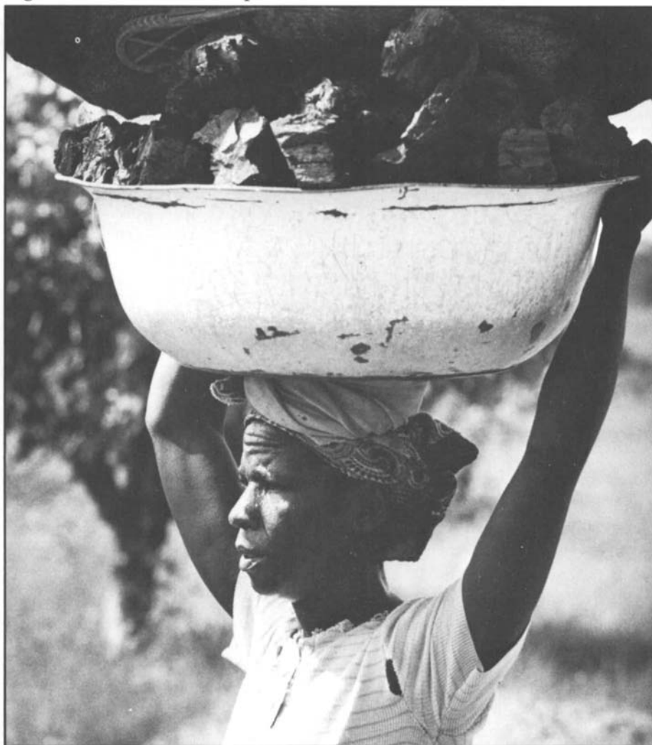
A Lobi woman walking to market in Gaoua, near Bobo-Dioulasso.

Sadly, Sankara's rhetoric produced few practical reforms. When a National Women's Week presented him with a list of concrete ideas, including a family code with a minimum legal age for marriage and the outlawing of forced marriages, they went unheeded. Instead, Sankara launched fruitless campaigns against prostitution and female circumcision. Nevertheless, his impassioned appeals to Burkinabè women to assert their rights may have had a more lasting impact than any legislation in changing their image of themselves. Inspired by his oratory, women gained confidence in the value of their work and started to insist that their menfolk respect it. The results may be detected in the fact that many local women's groups have sprung up in recent times, perhaps to run a village mill or to organise a handicrafts co-operative.