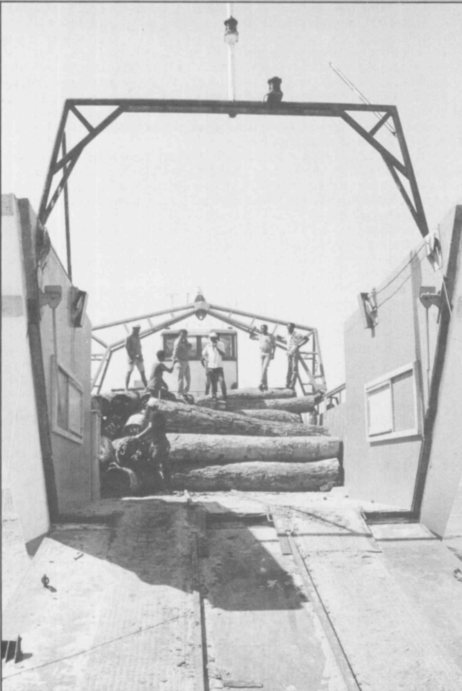
Mozambican timber being exported to South Africa.