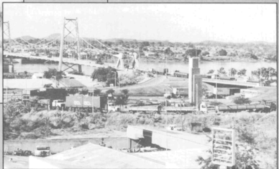
A convoy of lorries from Zimbabwe and South Africa, protected by the Zimbabwean army, assembles to cross the Zambezi at Tete.