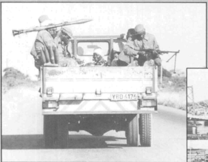
Often the only way to travel is to hitch a ride with the army.