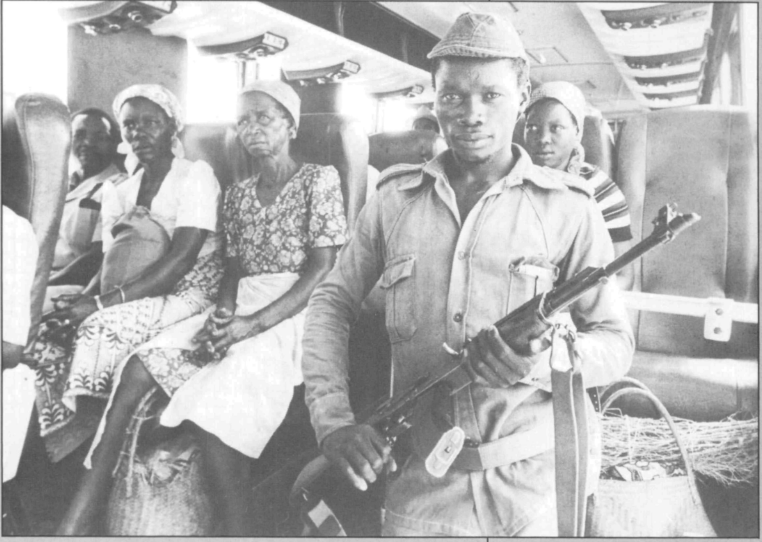
A military escort aboard a bus in Gaza province.