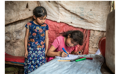
Two siblings in a family participating in an Oxfam programme in Guatemala's 'dry corridor'.

The poverty map is as follows: 73% of indigenous households and 70% of the rural population are poor (UN, 2010). Both in rural and urban areas, the indigenous population, particularly women and youth, are systematically excluded from economic, social and political processes through exclusionary economic policies and deeply rooted attitudes and practices such as racism and sexism in the private and public sectors. Generally women, indigenous people and peasant communities face different forms of exclusion which are related to deep problems of the socio-economic distribution of wealth, an acute lack of recognition of their identity and economic, social and cultural rights. At the same time, these groups are particularly affected by the high levels of violence that affect Guatemalan society at large, especially youth in urban communities.