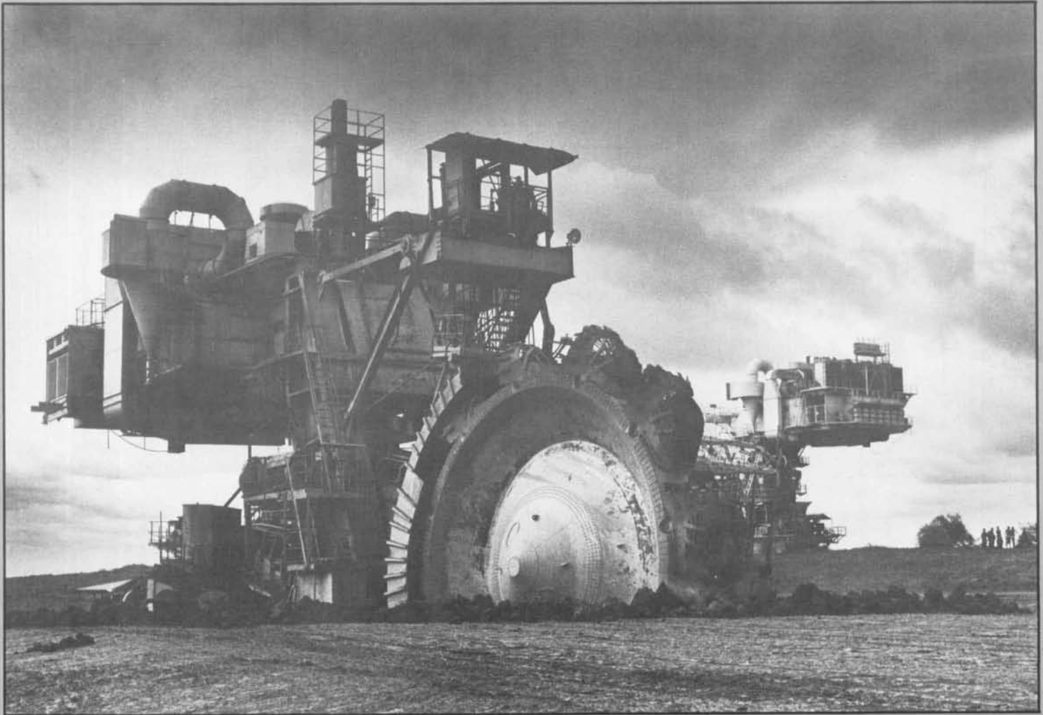
The Jonglei machine — tribute to almost every mistake that can be made in development