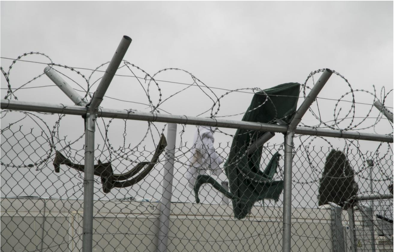
Barbed wire fences surrounding the refugee reception facilities on the islands.